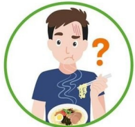
Loss of smell or taste

Other than common flu-like symptoms, such as fever and cough, monitor for these unusual ones. If you have been experiencing these symptoms, consult a doctor immediately