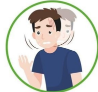
Altered mental status (Acute changes in personality, behaviour, cognition or consciousness)