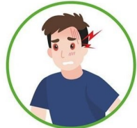
Conjunctivitis (Pink eye)