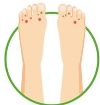
COVID toes, rashes on skin, or discolouration of fingers or toes