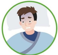
Loss of speech or movement